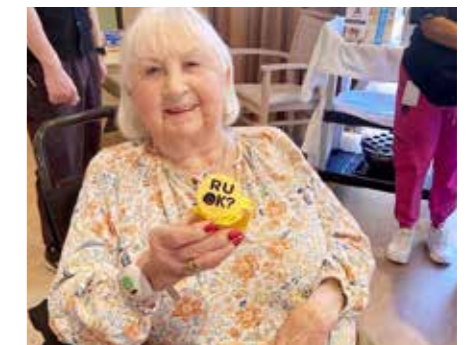
Residents helped prepare the cupcakes.